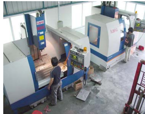
CNC Machine Center